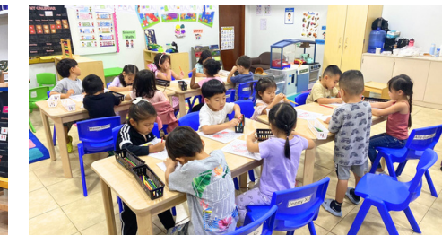
Here are the CDC Students doing different class activities: From left to right, our toddlers are doing manipulatives (building stuff using blocks and learning how to lace beads); our preschool students are reviewing their calendar (counting how many days in a week and more); Our Pre-Kinder class are coloring their story for this week, "Daniel and His Three Friends."