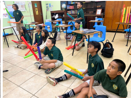
5th and 6th Graders are playing along with their Boomwhackers.