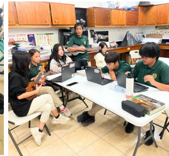
7th & 8th grades are practicing their serenades songs.