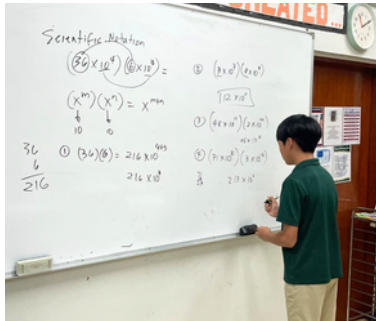
Here's a picture of a 6th Grader simplifying scientific notation problems.