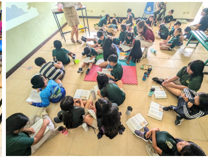
1st and 2nd Graders are doing Swords Up games tutorial.