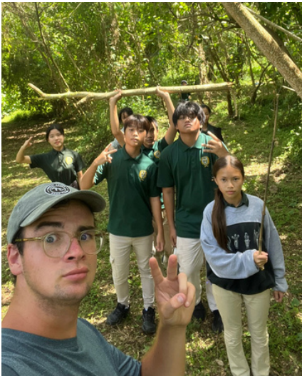
Grades 7 & 8 are in a jungle expedition with Mr. G!