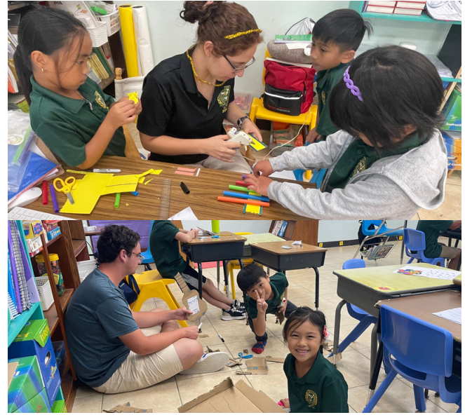
Grades 1 & 2 are being creative making different kinds of instruments!