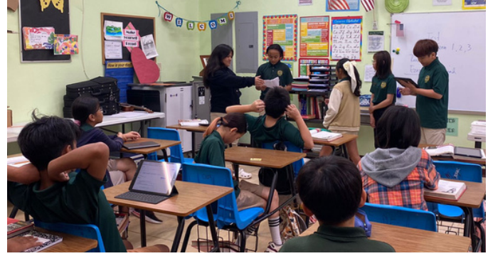
Grades 5 & 6 were having a short skit about the Transcontinental celebration.