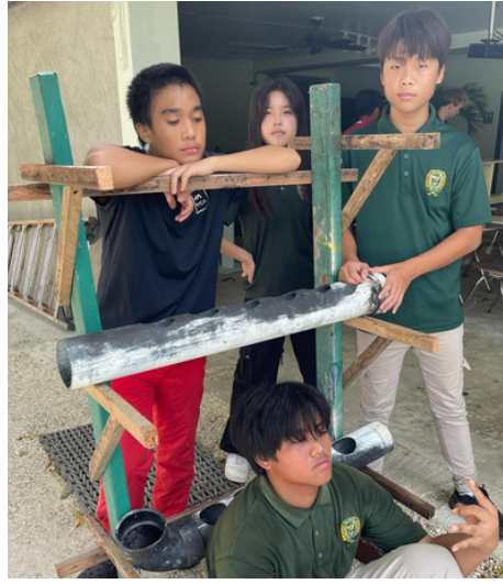
Grades 7 & 8 assembled the frame for the future hydroponics system and small fish pond.