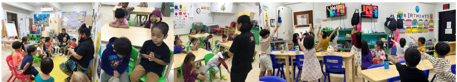
Here are some pictures of our CDC students doing worship time as part of their curriculum. This activity teaches them different important values like kindness, compassion, and love that will help them shape their character as they grow.