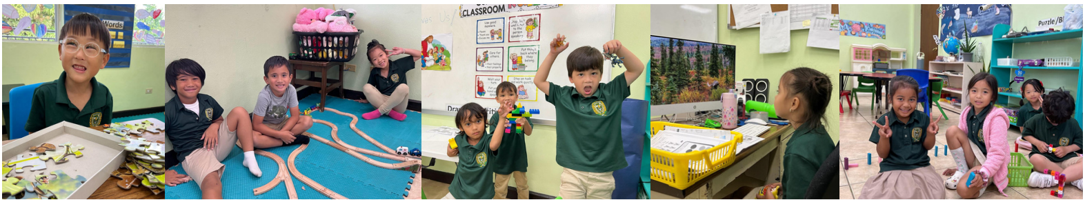
The Kindergarten Class during their center time! Some were playing puzzles, watching documentaries about the ecosystem, and getting creative with blocks, drawing, bugs and Jenga.