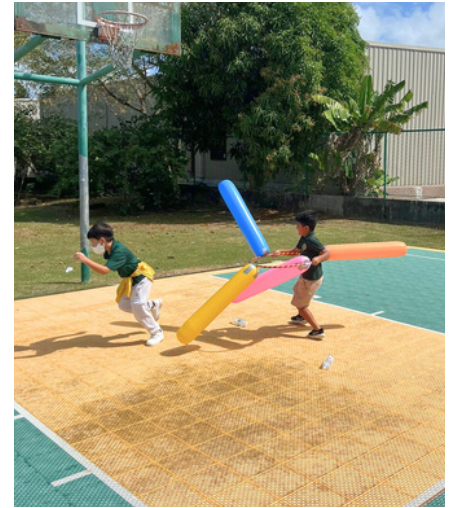
The Kindergarten students playing Octopus Tag during their Physical Education class.