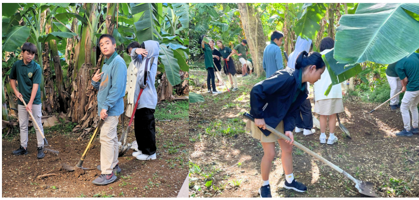
Grades 7 & 8 preparing plots for their future vegetable garden.