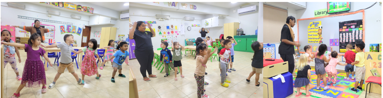
Here are our CDC students enjoying their morning exercise with their teachers. This daily morning routine will help our students with their physical well-being and warm them up for another day of learning and growth.