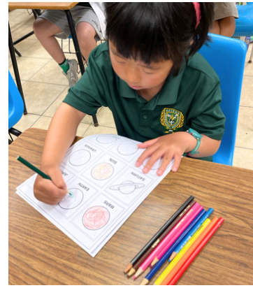
After discussing and analyzing the video on Solar System, Grades 1 & 2 colored their favorite planets.