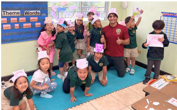
The Kindergarten class studied the story of the prodigal son, so they made pig hats!