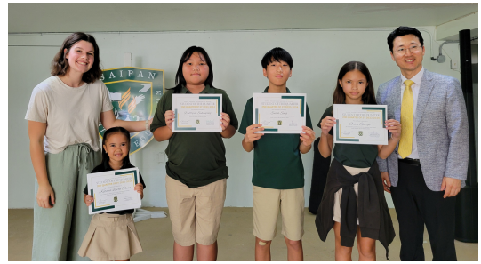
Students of the Quarter