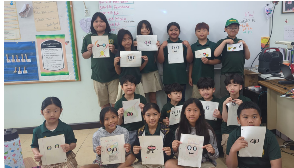
3rd and 4th Grade class 100th day activity- using digits 1 and 0 to make a concrete or abstract picture.