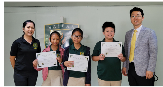
5th & 5th Grade Honor Rolls