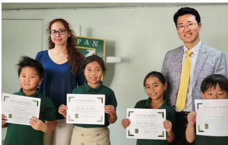
1st & 2nd Grade Honor Rolls