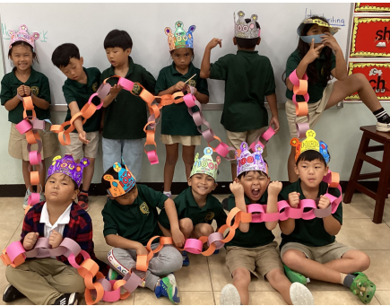
1st and 2nd Graders showing off their 100 days smarter crowns as well as their 100 chain links challenge.