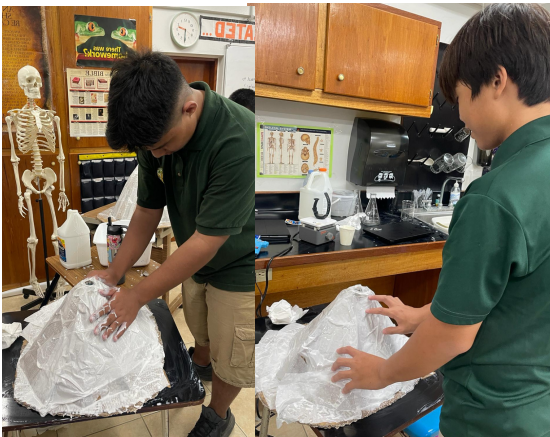
In preparation for our Science Fair, 7th and 8th Grade class made a volcano for their Earth Science class.