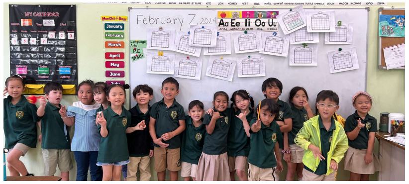
The Kindergarten class with their 100 Day Calendars! They've been counting all year for this day.