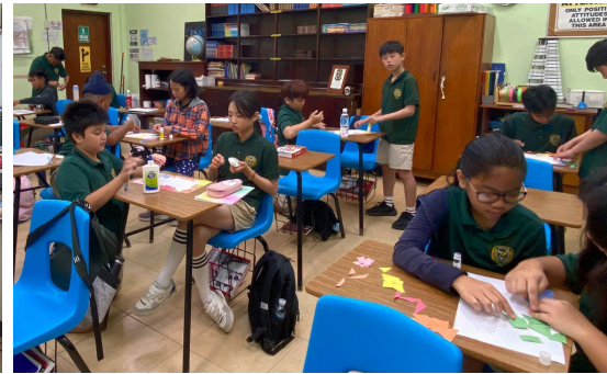
The 5th & 6th Grader's are collaborating to rebuild Jerusalem.