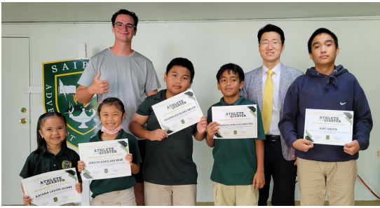
Athletes of the Quarter