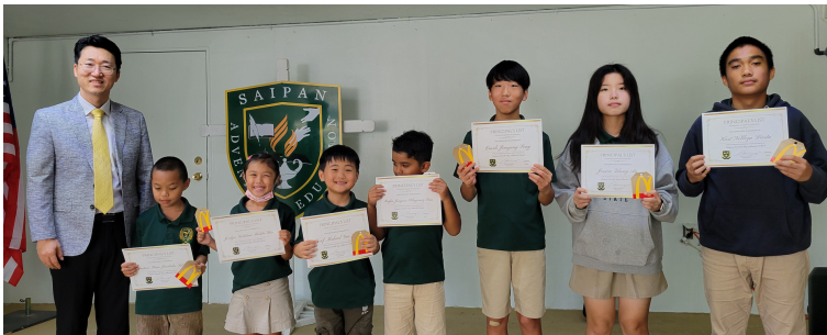
Principal's List from 1st to 8th Grade