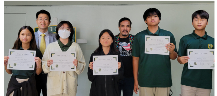
7th & 8th Grade Honor Rolls