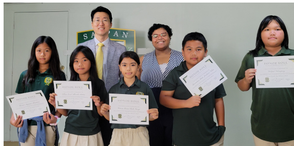
3rd & 4th Grade Honor Rolls