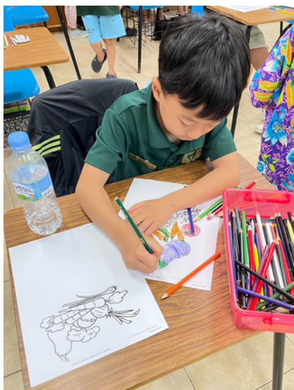
After discussing the 5 food groups, 1st & 2nd Grade color the food groups according to their respective colors