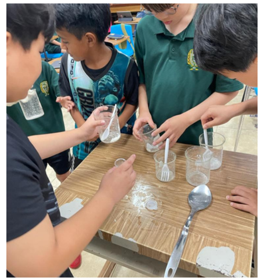
5th & 6th Grade doing Rock Analysis according to their Physical Properties...color, luster, structure, hardness, and size of crystals