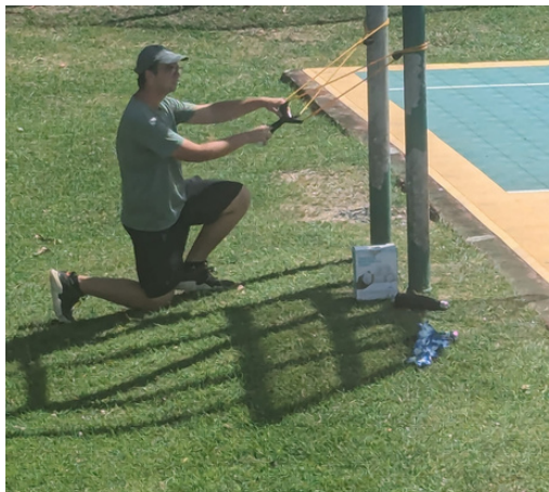
Slingshot indoor snowballs with the 3rd & 4th Grade students