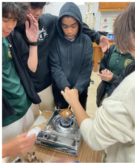
7th and 8th Graders are making delicious Dalgona!