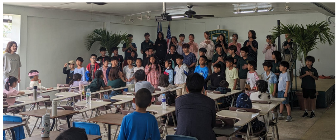
1st & 2nd and 5th & 6th Grade students sing "A Gift to You" for Special Music during Friday Chapel