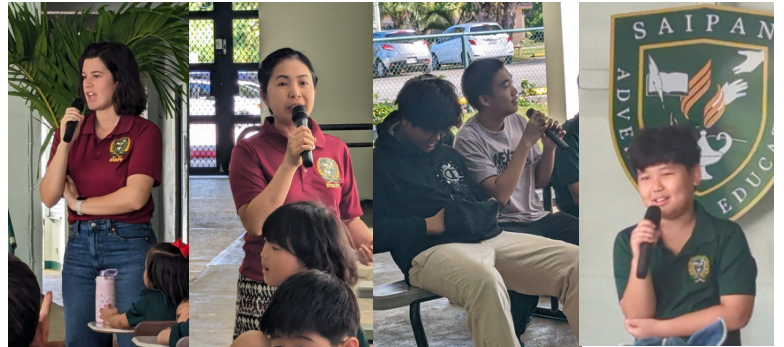
Our students and staff shared their testimonies about things they like during chapel period.