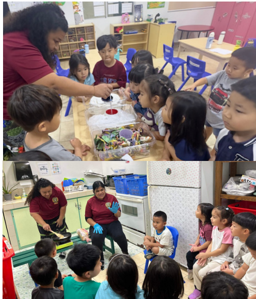
This week our Pre-Kinder students learned about heat. They did two kinds of experiments: the first one from the top is all about using the best material as insulator to keep the temperature of the hot water and the other one from the bottom is about how heat changes things when applied.