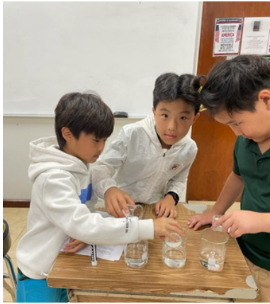
Grades 5 & 6 experimenting on factors affecting solubility of substance.