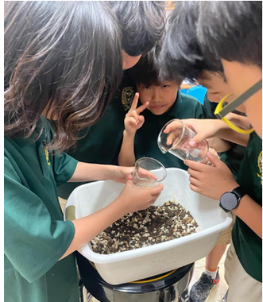
The article provides a guide to uncovering soil crystals using the acid test method.