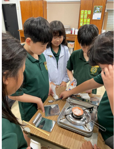
Our 5th & 6th are cooking Dalgona Candy, it's a Korean traditional candy made from baking soda and sugar.