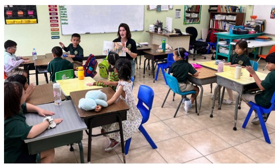
The Kindergarten students are attentively listening to their story of the week entitled, "Sam and the Lucky Money".