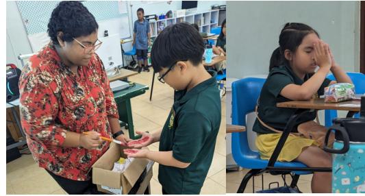
Our 3rd & 4th Grade students are experiencing the sacrifice of lambs for sins in the Old Testament Days.