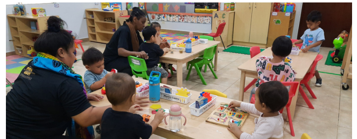
Every Friday our Toddlers are playing different kinds of manipulatives to help them develop their fine motor skills, hand-eye coordination, problem-solving abilities, and creativity.