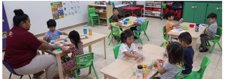
Half of the students in the Preschool class are playing blocks while waiting for their classmates to finish painting their bible story of this week. Playing blocks with their peers will help them learn important social skills such as sharing, taking turns, and working together.