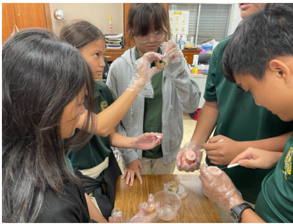
Time for some bone-chilling analysis! Our 7th and 8th grade masterminds are diving deep into the world of bones, exploring their fascinating functions.