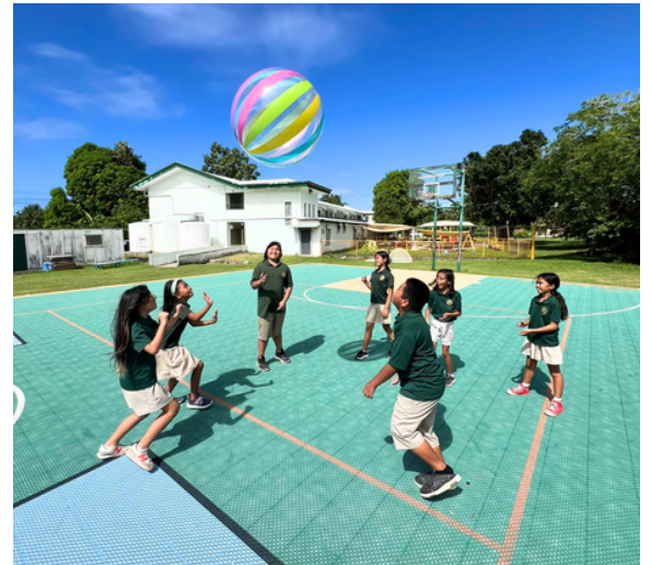
The little champs from Grades 3 and 4 are smashing it at beachball volleyball!