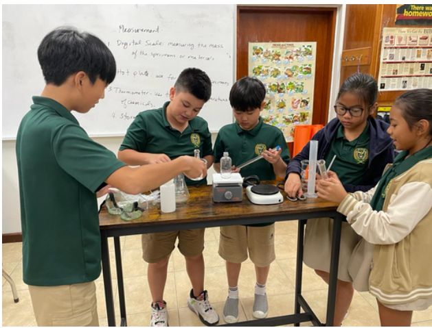
Get ready to don your lab coat and goggles! Step 5 and 6? Grabbing all the coolest science gear for the next big experiment!