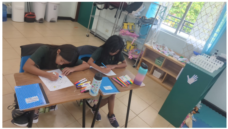
It's pizza and movie day and the artsy 3rd and 4th graders are jazzing things up with their very own colorful paper decorations!