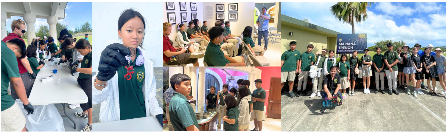
The adventurous 7th and 8th graders embarking on their epic field trip!