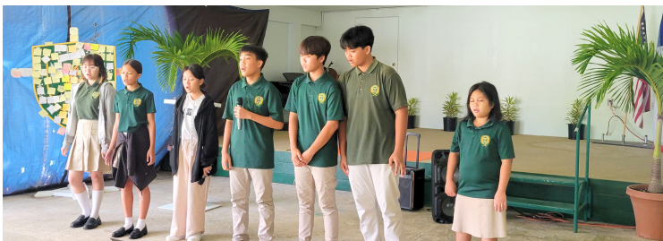
Our 7th & 8th Grade students performed the song "Lord I lift Your name on High". And we want to appreciate them for successfully leading out their parts in the Spiritual Emphasis Week. Amazing work you guys!!!!