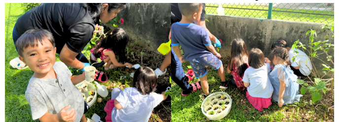
Our Pre-Kinder students had quite a lot of fun as they replanted their mongo bean seeds into the ground. There are quite a few things that they can learn outside their class by simply doing some basic tasks through observation, and hands on activities.