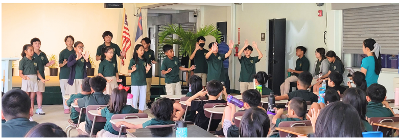
Here's our 5th and 6th students performing "We are His hands" giving out a presentation deserving an applause.