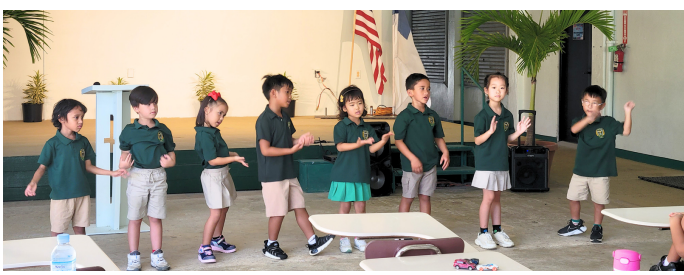
Well done Kindergarten students for your outstanding performance of the song "When I get to Heaven".