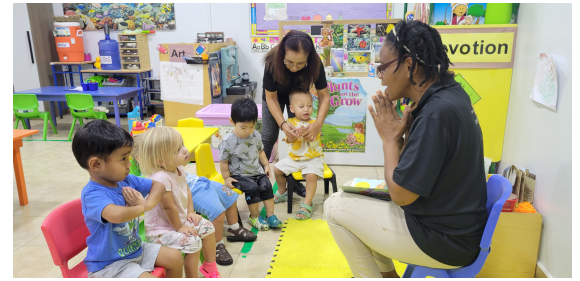
Meanwhile our toddler students were doing worship time together with their teachers showing a great enthusiasm on their activity.