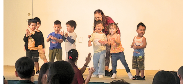
From the Preschool students they also joined in our Spiritual Emphasis Week with the song "Let us come together and praise the name of Jesus" Good job kiddos!