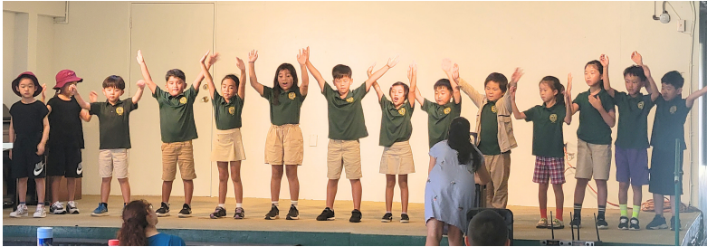
Our 1st and 2nd grade students performed the song "I am thankful" and delivered quite an amazing job.