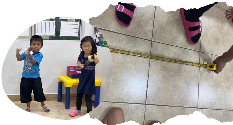
Let's do some math: How far can your marshmallow fly? The Pre-K kiddos are taking on the world of physics with their trusty Plastic Cup Marshmallow Launchers. Can you believe how cool this science experiment is?