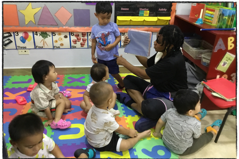
Our Toddler Class are exploring the wide world of colors!