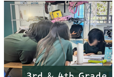
3rd & 4th Grade

Our Grade 3 and 4 are enjoying the tour via Travelogue-Pamphlets surfing the overview of the beauty of Mexico, Caribbean, and Canada. Next week Wednesday they are off for another Field Trip. Guess where? Find out next issue.