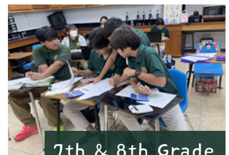
7th & 8th Grade

SOH CAH TOA what? Our Grade 7 and 8 students are learning advanced subject in Math. They are computing for the missing X of a right triangle using Trigonometric Functions and Direct Method of Measurement. Remember X mark the spot.