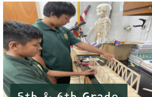
5th & 6th Grade

Is that the longest Popsicle Stick Bridge? Our Grade 5 and 6 designed and made their Popsicle Bridge during their Applied Math Classwork activities. You can view their works during our SAS Science Fair Week. Coming Soon to the Saipan SDA School near you.