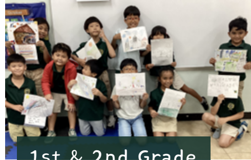
1st & 2nd Grade

Good job Grade 1 and 2. They are studying the structure and importance of our Local Government. They also discuss what will happen to us if we don't have an efficient LG. Wow, that's deep.