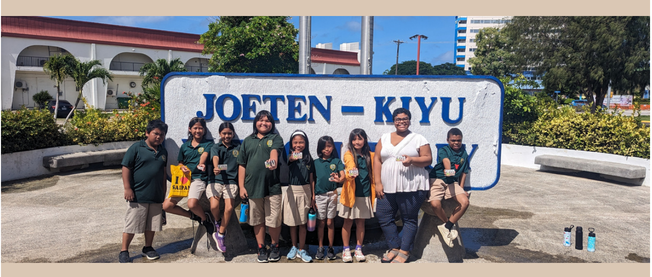
The 3rd and 4th graders went to the Joeten-Kiyu Library for a field trip!